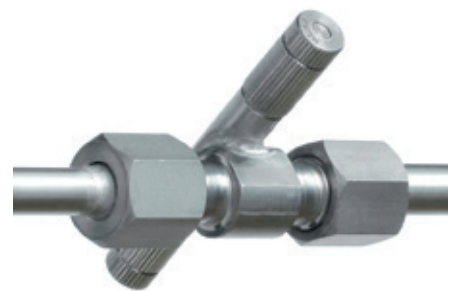
ML Flex System

The ML Flex system is made from highquality stainless steel.